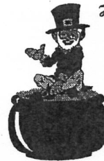
Happy St. Patrick's Day

It's Almost Spring . . . Enjoy the upcoming holidays!