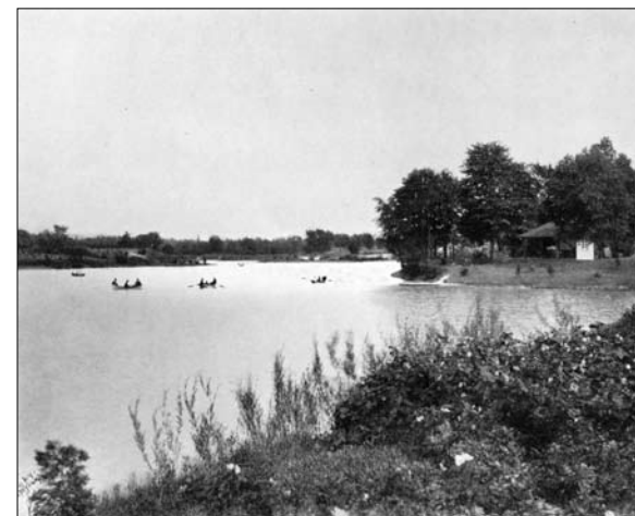
Figure 1: The old Shaker Canoe Club on the south bank of the Lower Lake.

The two northern Shaker Lakes – Lower and Horseshoe – border Cleveland Heights on the north and Shaker Heights on the south. The lakes themselves are owned by the City of Cleveland and leased to the City of Shaker Heights for $1 for 100 years. They also are the area's largest manmade reminder of the once vibrant Shaker settlement that existed here in the 19 th century. The most extensive structural evidence is at the western edge