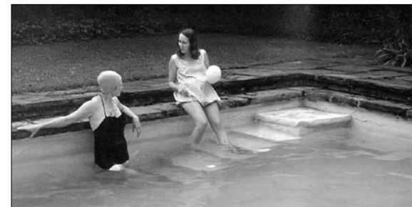
Figure 6: Bathers enjoy the Briggs Estate swimming pool, c., 1960.

While wood remnants are few, several do exist. One is the gateway to the Forest Hill development, partly in Cleveland Heights. It is the smallish, gray-blue-shingled cottage at Lee and Monticello Boulevards. This was once Abeyton Reality—the Rockefeller developers’ real estate office. It now serves as the headquarters of the Forest Hill Homeowners Association. Until relatively recently, the Rockefeller family stables stood not far from the Forest Hill