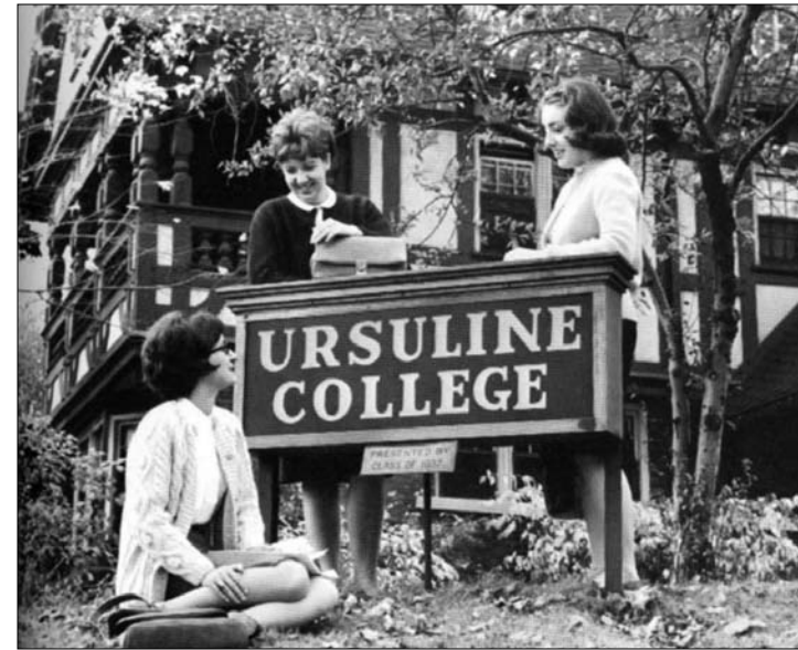
Figure 3: Coeds hang out in front of the Ursuline Library, formerly the Harmon Kelley House at Cedar and Overlook Rd., c., 1966.

and held interests in oil, iron, steel, cement, coke, gas, and railroads. Other remnants of the Eels era include the stone gates that link various segments of the wall, additional stone and stair segments behind the building, and the fascinating placement of the mansion’s original front door into the existing building (Figure 2).