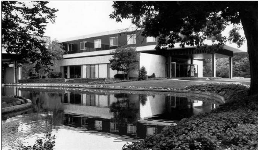
Figure 4: The small lake adjoining the Courtyards of Severance previously enhanced the Austin Company landscape.

The North Taylor walls seem quite plain compared to the magnificent stone and brick