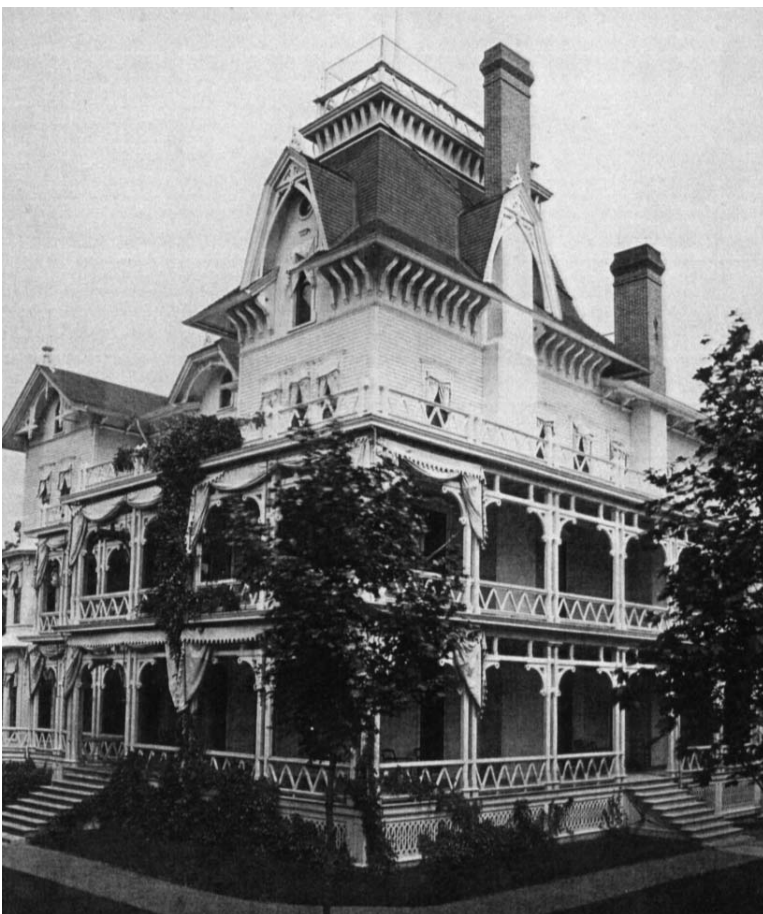
Rockefeller's "Homestead." The magnificent structure stood close to the crest of the giant hill, just up from what is now Terrace Road.

In 1873, Rockefeller purchased Forest Hill, a tract of land bordering Euclid Avenue in East Cleveland. Initially, he treated the land as an investment and sold it to the Euclid Avenue Forest Hill Association in 1875 to be developed as a water-cure resort. ii However, when the venture failed, Rockefeller reacquired Forest Hill and completed the half finished sanitarium as a summer home for his family in 1878. Rockefeller did make one final attempt to generate